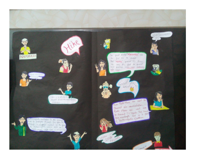
use of Electromagnetic spectrum