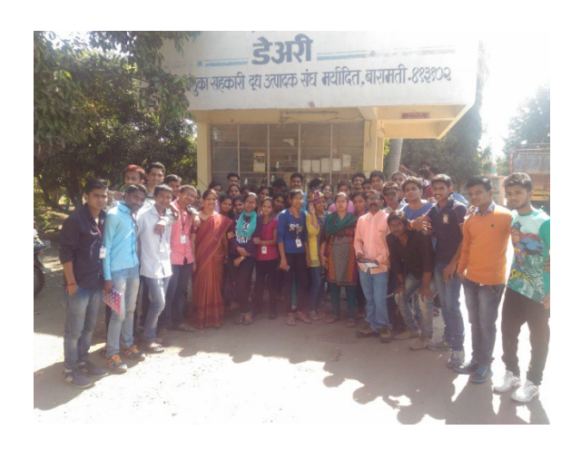
Study tour- F. Y. B Sc