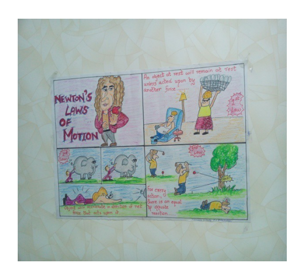
Laws of motion